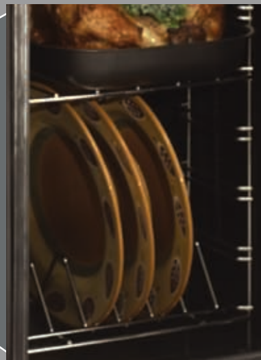
Plate Warming Rack

No other 36" pro-style range has this much to offer